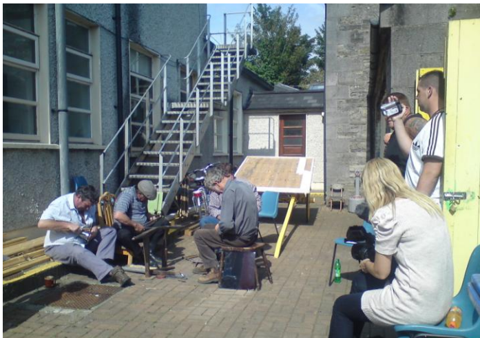
A film crew from "My Big Fat Gypsy Wedding" films our tinsmith group