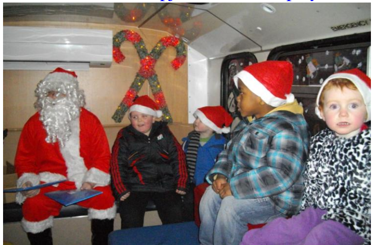
Is it really him? Meeting a very special person on the Ho Ho bus!