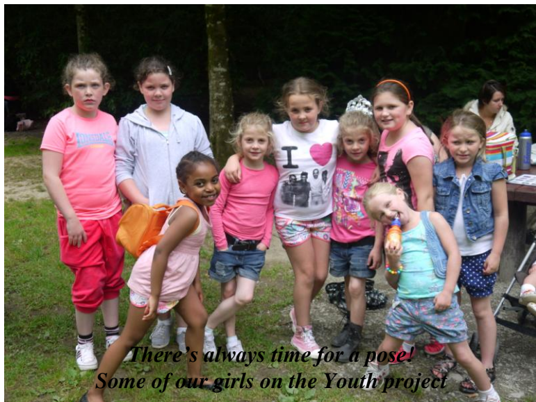
There's always time for a pose! Some of our girls on the Youth project

Crann Support Group administers the finances of the Little Angels childcare services. The Crann group support 11 different community groups throughout the county. This back up and support has ensured the children have the opportunity to avail of the excellent service provided by the Little Angels childcare staff. Crann also support access to knowledge, expertise and training that ensures this quality is maintained.