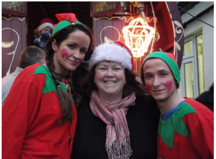
You don't have to be mad to work here. but....

Local mediation has taken place with the support of MTW and in negotiation with An Garda Siochana. The mediation can be a long process where dialogue begins to take place with family representatives. This dialogue can only take place in the absence of violence and in a safe and neutral environment.