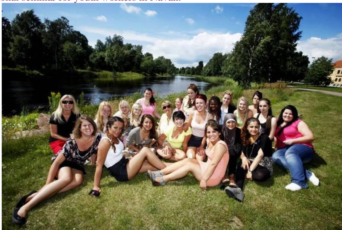
Honestly.. it was very hard work! The MTW group with their Swedish colleagues

Interaction with other peer groups, at home and abroad is very important to us. In July of this year, 10 young women representing Meath Travellers Workshops Ltd travelled to an important conference in Karlstad, Sweden. The Navan group joined up with Kurdish and Gypsy women for an international project called “Breaking the Pattern” which examined women's roles in each community. They spent their time having fun and invigorating discussions about what it means to be a young woman today through a full schedule of presentations, seminars and workshops. In August 2012, MTW will be returning the favour by hosting a similar international seminar for youth workers in Navan.