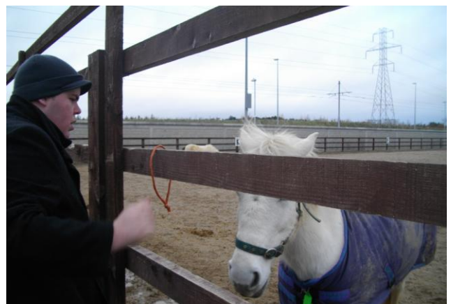
In December, members of the Workshop visited the Horse Project in Tallaght

During 2011 the CE programme offered work experience and training to 21 participants in the following areas: