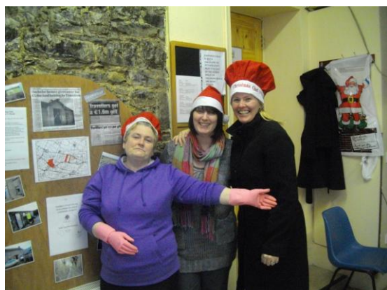
Welcome to MTW!

The pre-school displayed all our youth activities, there were displays around the building, our tinsmiths explained their work in the shed and the visit was ended by hot non-alcoholic punch and a mince pie. Following on from the day we had a follow up request from one of the schools, An Bradan Feasta in Laytown, asking us to come to visit them, they enjoyed the Open Day so much.