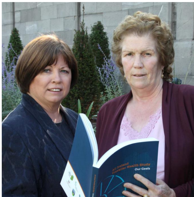
Important reading at the launch of the Health Study report

The findings of the All Ireland Traveller Health Study were saddening, but not surprising to the community. A total of 10,618 families took part in the study (9,056 families in the Republic of Ireland and 1,561 in Northern Ireland). The Traveller population on the island of Ireland is estimated as 40,129 (using the average family size in Republic of Ireland as 4 and Northern Ireland as 2.5)