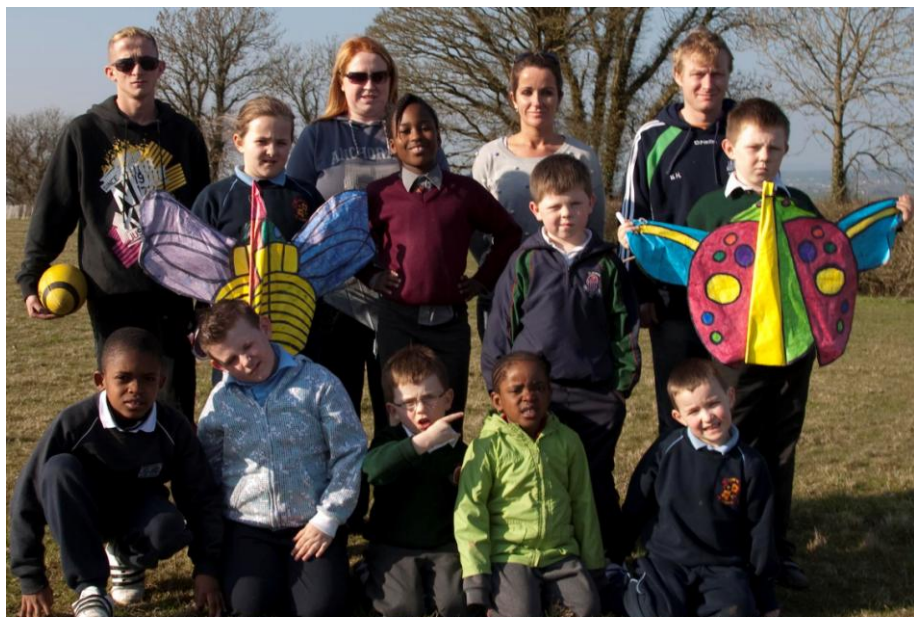
Reaching for the sky – Our afterschool group take part in the Kite project

On the 24th March the MTW after schools group joined a number of community groups from across the county at the Hill of Tara to launch the Kite Project marking the EU Week against Racism in County Meath.