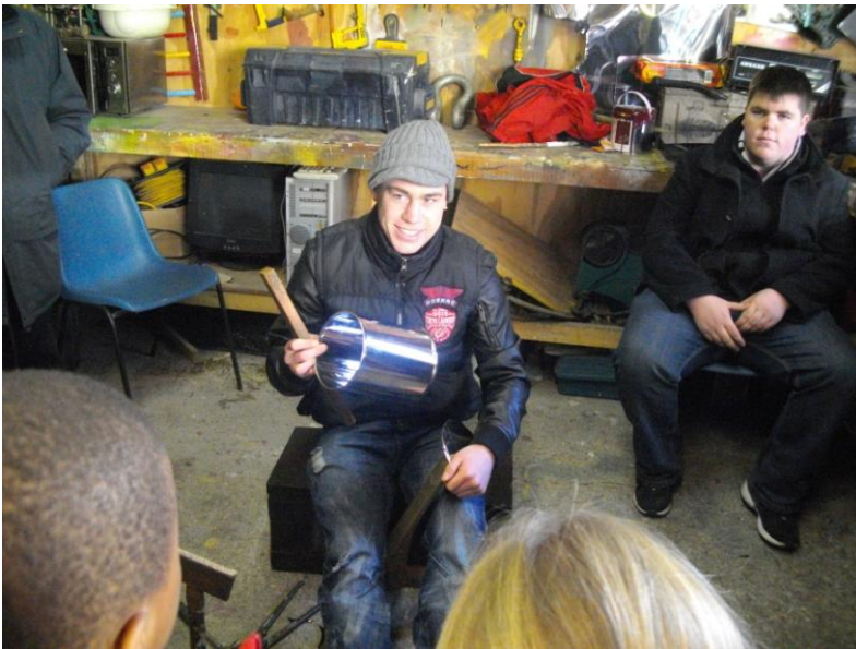
Two work experience students from Youthreach show off their new tin skills at the MTW open day

Volunteers and Students regularly request placements with our organisation. Following on from a Volunteer Management Training course we attended through Meath Volunteer Centre, we have now in place a simple contract to ensure that the expectations of the volunteer and ourselves are clear from the outset.