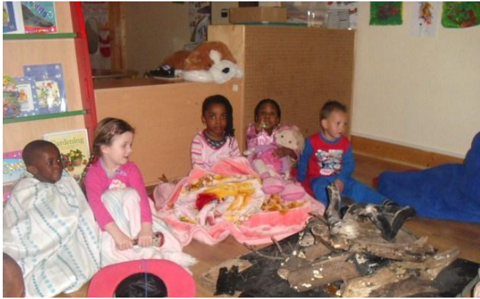
The pre-school children enjoy a slumber-party camp out in their class

The Pre-School sessions cater for 10 Traveller and settled children in the 3-5 year age group. It is a well-run and well-equipped facility which provides a comfortable and safe environment for all our attending children. This year, our pre-school and after-schools swapped rooms. The younger group moved to the smaller room and the afterschool settled into the bigger room. This was due to the increased demand for the after-school programme this year. The change has worked out well with both groups happy in their new locations.