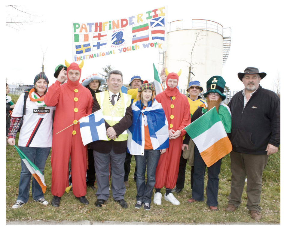
Pathfinders Participants meet with the Mayor of Navan on St Patrick's Day

The level of participation was extremely high, with a high degree of energy and enthusiasm shown by all the seminar participants. It was a fantastic week of sharing and learning, and the feedback from the international partners highlights the enjoyment experienced by all who took part.